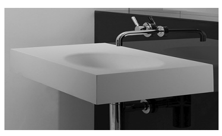
Also available as a wall-mount sink, MTCS-736D. See product specification sheet for details.

Fixed Drain Without Overflow Chrome (DKFDC) $300