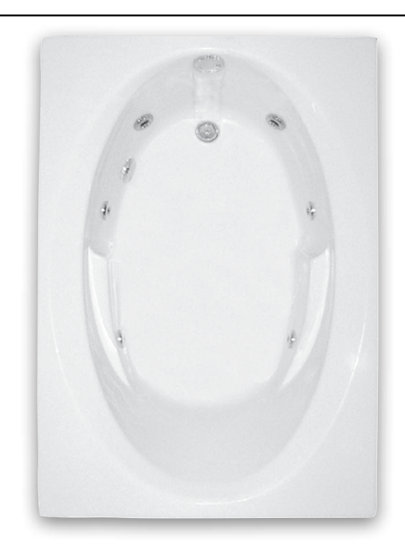
Model 6024 (Shown with trim upgrade and Lift and Turn drain)