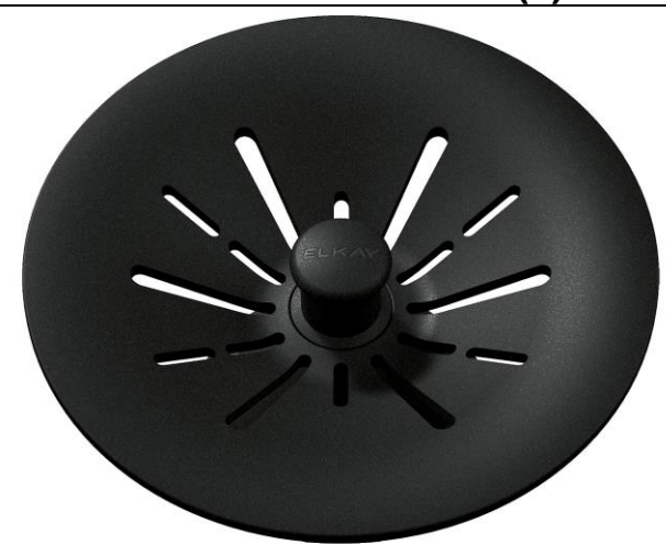
AMERICAN PRIDE. A LIFETIME TRADITION. Like your family, the Elkay family has values and traditions that endure. For almost a century, Elkay has been a family-owned and operated company, providing thousands of jobs that support our families and communities.