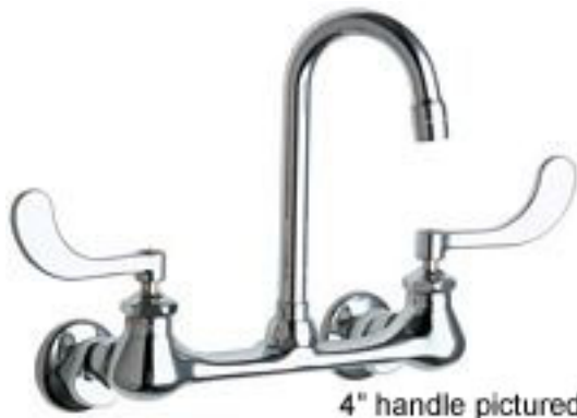
4" handle pictured