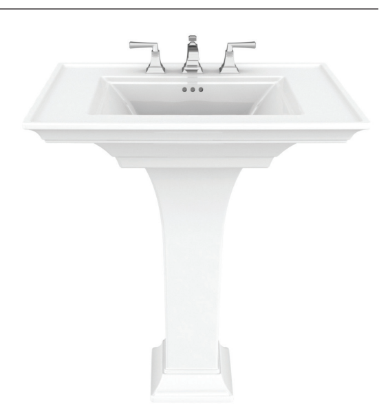
Town Square S pedestal combination 0297800