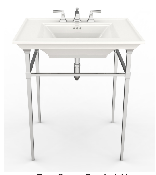
Town Square S pedestal top sink 0297008 shown with 8721000 console table